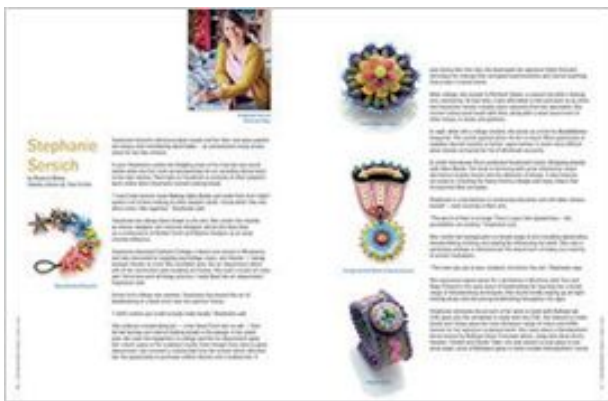
Artist Spotlight — Glass + Medium