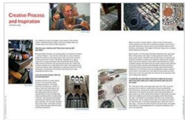
Artist Insights — Glass