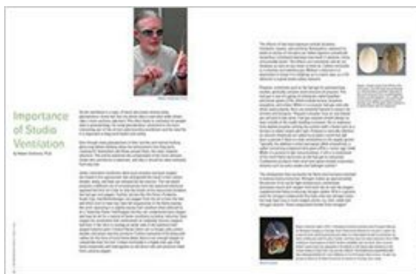
Science & Safety — Glass